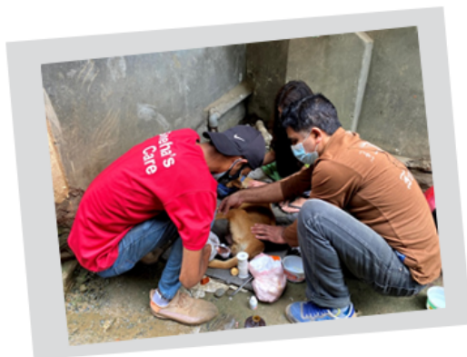
Mobile Treatment: Hit and Run case at Satungal (Pregnant Mother)