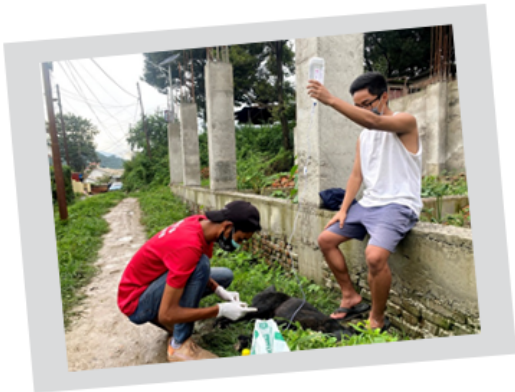
Mobile Treatment: Nose Tumor at Bishnumati