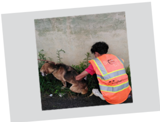
Mobile Treatment: Dog Fight Case