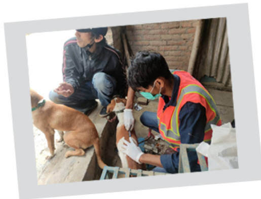
Mobile Treatment: Skin Disease at Bhainsepati