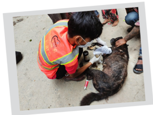
Mobile Treatment: Hit and Run case at Kalimati